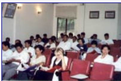
There were about 50 participants from mine victims and disabilities and rehabilitation sectors attended the National Workshop on "Victim Assistance".

The focus of the workshop aimed mainly on reviewing and finalizing of the draft national strategic plan on victim assistance in Cambodia. The linkage between components of victim assistance and relevant section of the DAC Strategic Directions for Disability and Rehabilitation was also another focus of the workshop. The proposed list of the Cambodian delegation to the First Regional Conference on Victim Assistance in the framework of the Mine Ban Treaty - South East Asia that will be held in November 6-8, 2001 in Thailand has been produced.