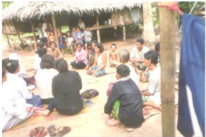
Women with Disability Committee meet with disabled women who is members of Banteay Srie's Project in Siem Reap on 27/06/02

◆ DAC coordinated a letter of support from the Ministry of Education to all provincial/municipal offices of education giving support to NGOs promoting education for children with disabilities and Inclusive Education pilot program.