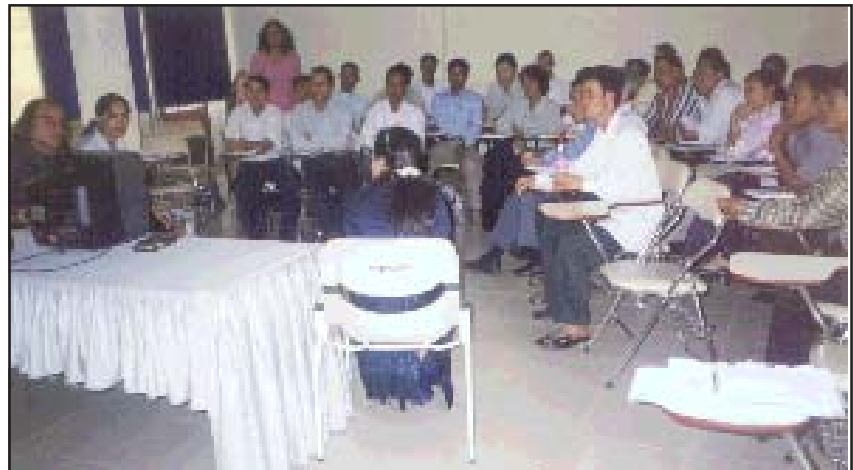
Workshop on what is "Sign Language" 05-06/09/02 at the National Institute of Public Health

The DAC would like to take this opportunity to express a deep sincere thanks to ADD, Maryknoll, NCDP and DDP for their financial support and consideration to the workshop as well as all the participation, consideration with great interest.