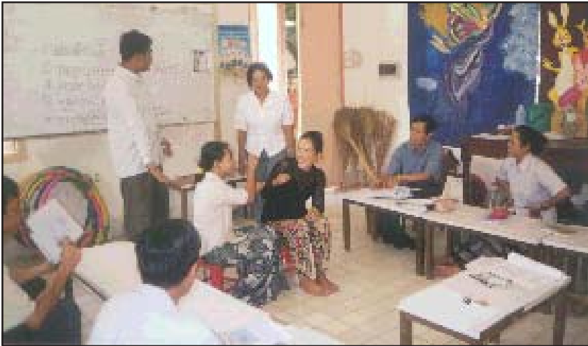
Training on Behavior Management at Nutrition Center 12-13/09/02

Materials for teachers are available at the Disability Action Council regarding behavior management in the classroom.