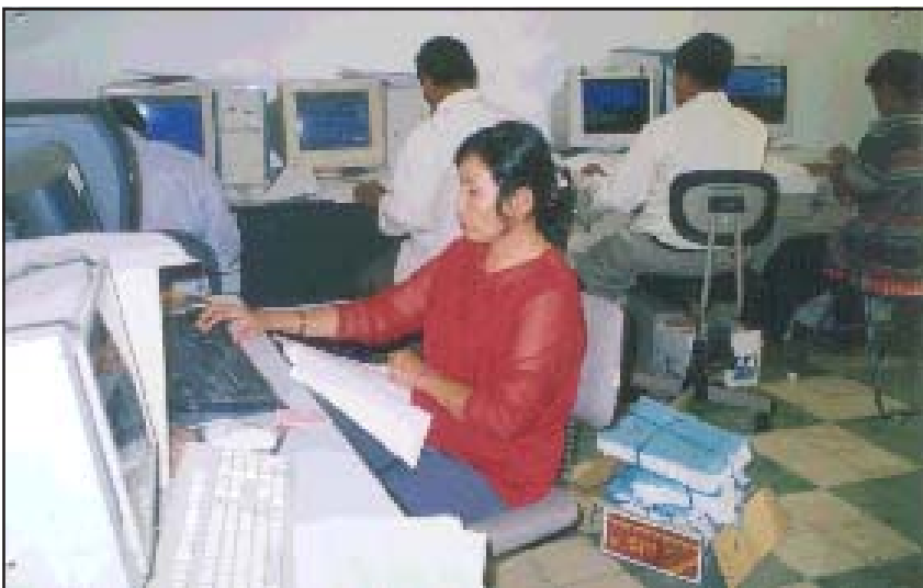
July 02, 6 data entry clerks computerizing data collected during survey in the month of June 02 in Kampong Speu Province at the Central based Phnom Penh.

(DAC/MOSALVY and MOP/NIS) will significantly benefit the development of projects to integrate and assist people with disabilities in Cambodia.