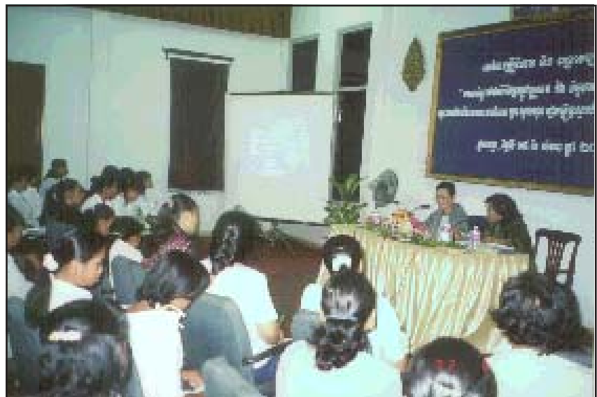
Women with Disabilities Forum on the Draft of Legislation "Domestic Violence and Victims Protection"; Presided over by H.E. Mrs. Mua Sochua, Minister of MWVA, August 15, 2002.

Integration of women with disabilities into the existing activities of Neary Rattanak planning as well as Annual Report of MWVA. The consideration to involve women with disabilities at the provincial level in all special events in Cambodia. She also addressed and explained the draft legislation "Domestic Violence and Victim Protection" to women with disabilities.